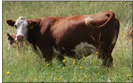
Snowshoe NL Fiona U22 E28 - Dam of 59N