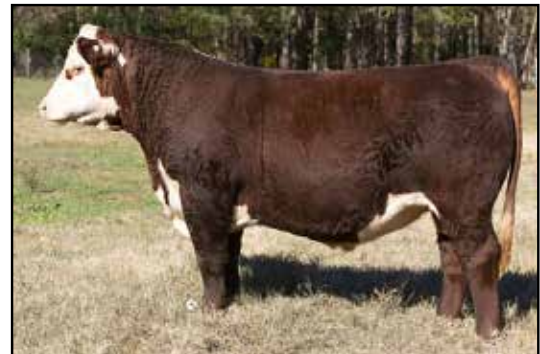
Innisfail Trademark 1939 ET - Sire of 19N, 39N & 78N