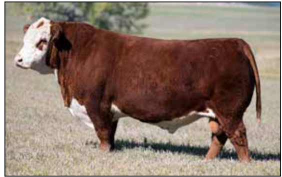
CSC 901 Bolder 701- Sire of 10N, 11N, and 13N

11N A REG: 44700993 DOB: 2/6/25 Polled SNOWSHOE 901 BOLDER J31 11N