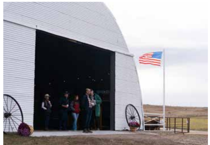
Join us inside our renovated Quonset for the sale this year