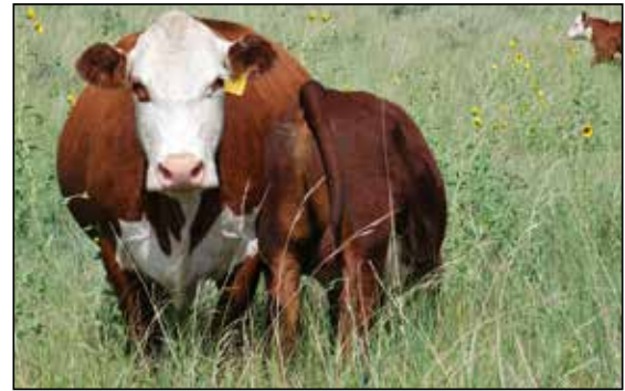
Snowshoe 90X Montna Maid D71 - Dam of 77N and MGD of 136M