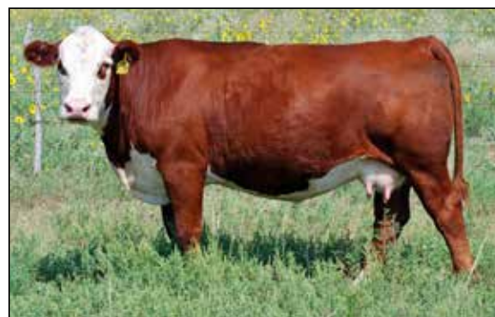
Snowshoe 90X Tori A78 E73 - MGD of N102