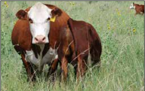
Snowshoe 90X Montana Maid D71 - MGD and Dam of 77N