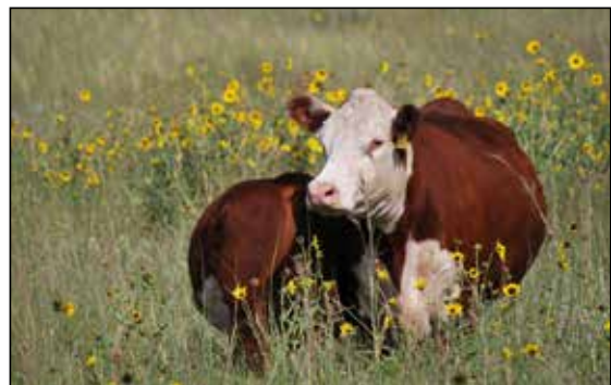
Snowshoe 206E Serena D03 J09 - Dam of 85N