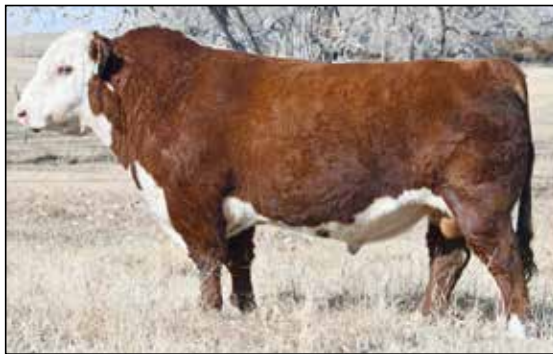
JDH 21Z VICTOR 33Z 40E ET - Full Brother to Dam of 67N