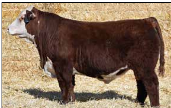
Snowshoe Bottom Line F03 26J - Maternal brother to dam of N65 - Owned with Aden Family Farm, IL