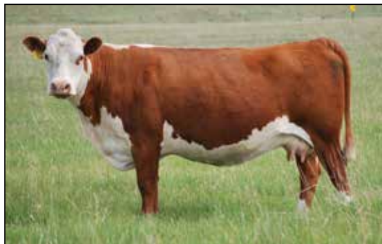
Snowshoe 23Y Perfect Miss C39 - MGD of 16N and 46N