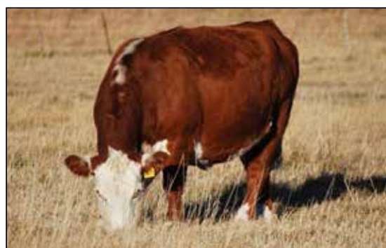
Snowshoe 42Z Clara Belle B43 - Maternal sister to the dams of N31 and N74

N32 A REG: 44700987 DOB: 2/13/25 Polled SNOWSHOE 1939 SAVANNA E42 N32