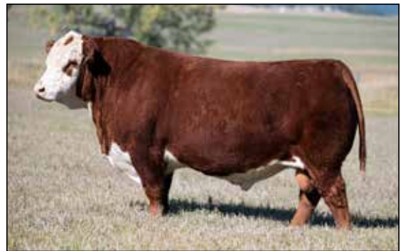
CSC 901 Bolder 701 - MGS to 29N, 30N and 36N