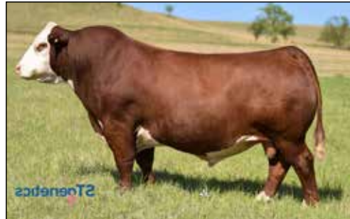
SHF Houston - Sire of 05N, 07N