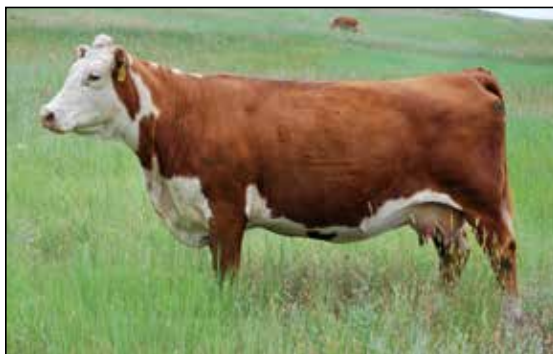
Snowshoe P606 Selena U06 ET - MGD of 20N and MGGD of 47N & N18