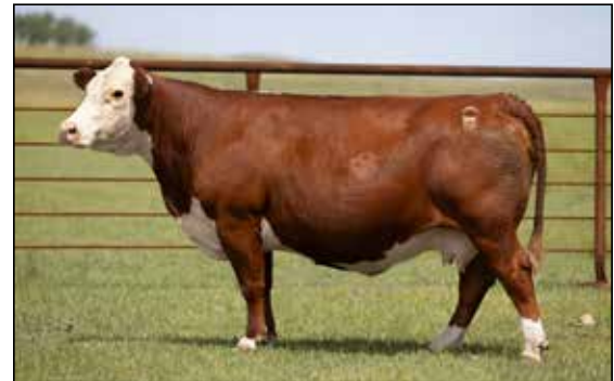
Snowshoe 90X Montana Maid D74 - MGD of 112N