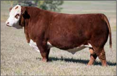
CSC 701 Bolder 901 - Sire of 136M, 151M