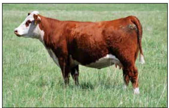
Snowshoe Perfect Miss C39 G04 - Dam of 46N

57N A REG: 44702303 DOB: 2/20/25 Polled SNOWSHOE 901 BOLDER G07 57N