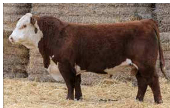
Snowshoe 81E Historic J22 39L - Sire of N102 & N110 Owned with James Hinshaw, IA