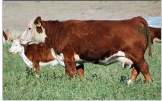
Snowshoe 19C Catalina C36 E51 - MGD of 29N