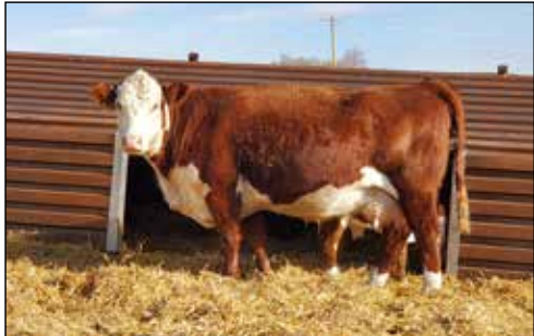
Snowshoe 134F Breeze E14 H24 - Dam of 07N