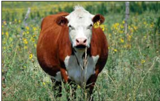
Snowshoe 19C Tori 31S E75 -Dam of 96N