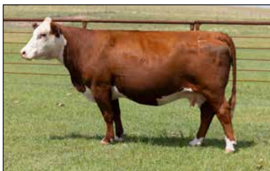
Snowshoe 33Z Breeze T24 F111 - Maternal sister to the dam of N60