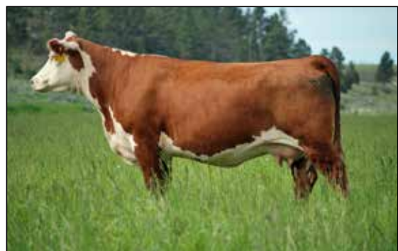
Snowshoe P606 Serena T44 ET - MGGD of 85N