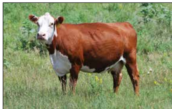
Snowshoe 33Z Selena U06 G41 - MGD of N18