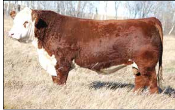
WLB Mr Canada 10Z 15B - MGS of 05N, 72N, and 115N