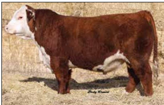
Snowshoe 42Z Ruffneck F62 153J - Sire of 76N