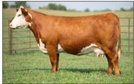
WHR 284D 366E Beefmaid 112G - Dam of 2242

REF A REG: 44369844 DOB: 3/11/22 Homo Polled H AMPLIFY 2242 ET