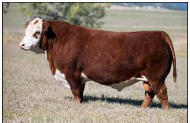
CSC 701 Bolder 901 - Sire of 96M