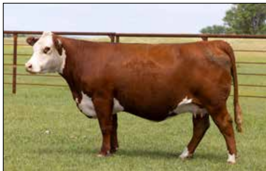
Snowshoe 101F Shimmer F04 J81 - Maternal sister to the dam of N55