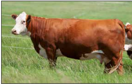
CSC 502 Lady Dew 701 - Dam of 901