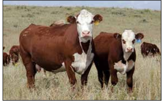
Snowshoe 90X Selena Y05 E55 - Dam of 91N