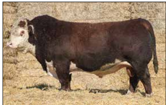
TH 49B 358C Drover 134F - MGS to 07N, 11N, 47N, 76N, 83N, 98N and 100N