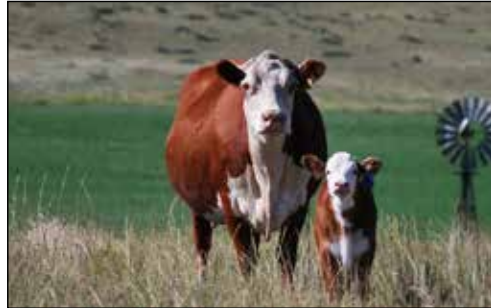
Snowshoe 422 Selena Y05 B23 - Dam of 151M