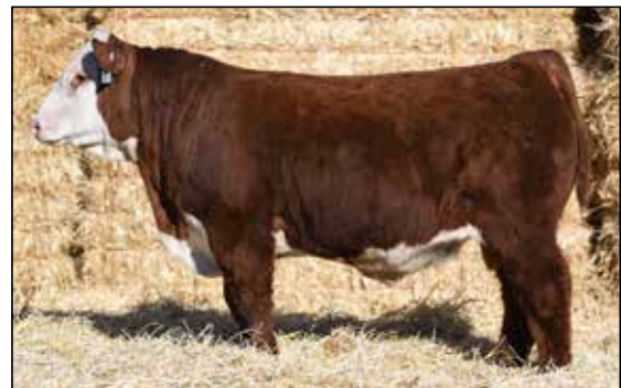
Snowshoe 33Z Conquest F07 54J - Maternal Brother of 71N Owned by Wagner Herefords, SD